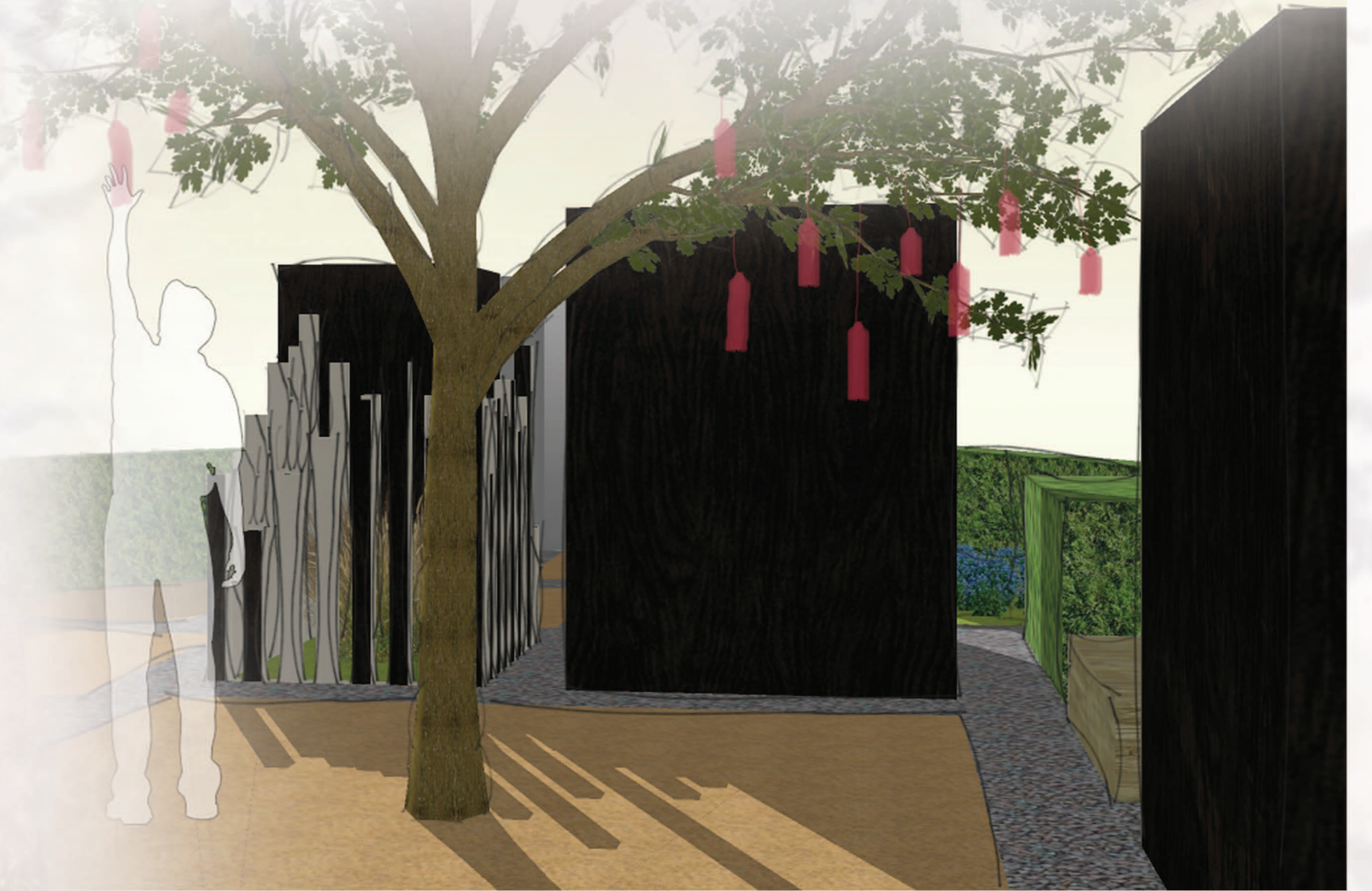
MEMORY TREE. HERE YOU CAN WRITE DOWN AND LEAVE MEMORIES YOU NEVER WANT TO FORGET

LOST MEMORIES. NO INTERACTION POSSIBLE. LATE STAGES OF ALZHEIMER DISEASE FOR EXAMPLE: NOT RECOGNIZING FAMILY MEMBERS AND SURROUNDINGS.