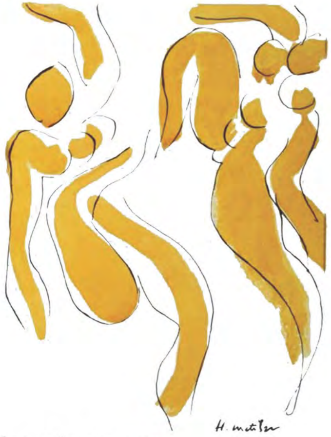
STUDY FOR "THE DANCE", 1932 MATISSE DRAWING (theartstack.com/artist/henri-matisse/study-for-dance-1932)